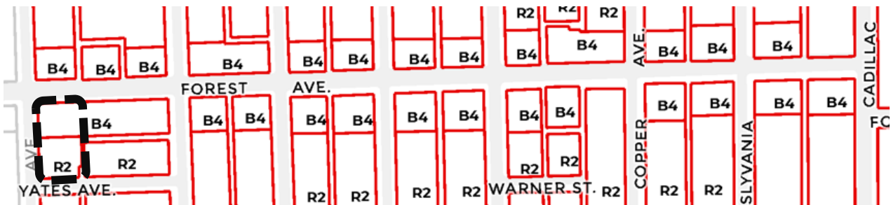
East Forest Avenue corridor from Crane St to the west and Cadillac Ave to the east