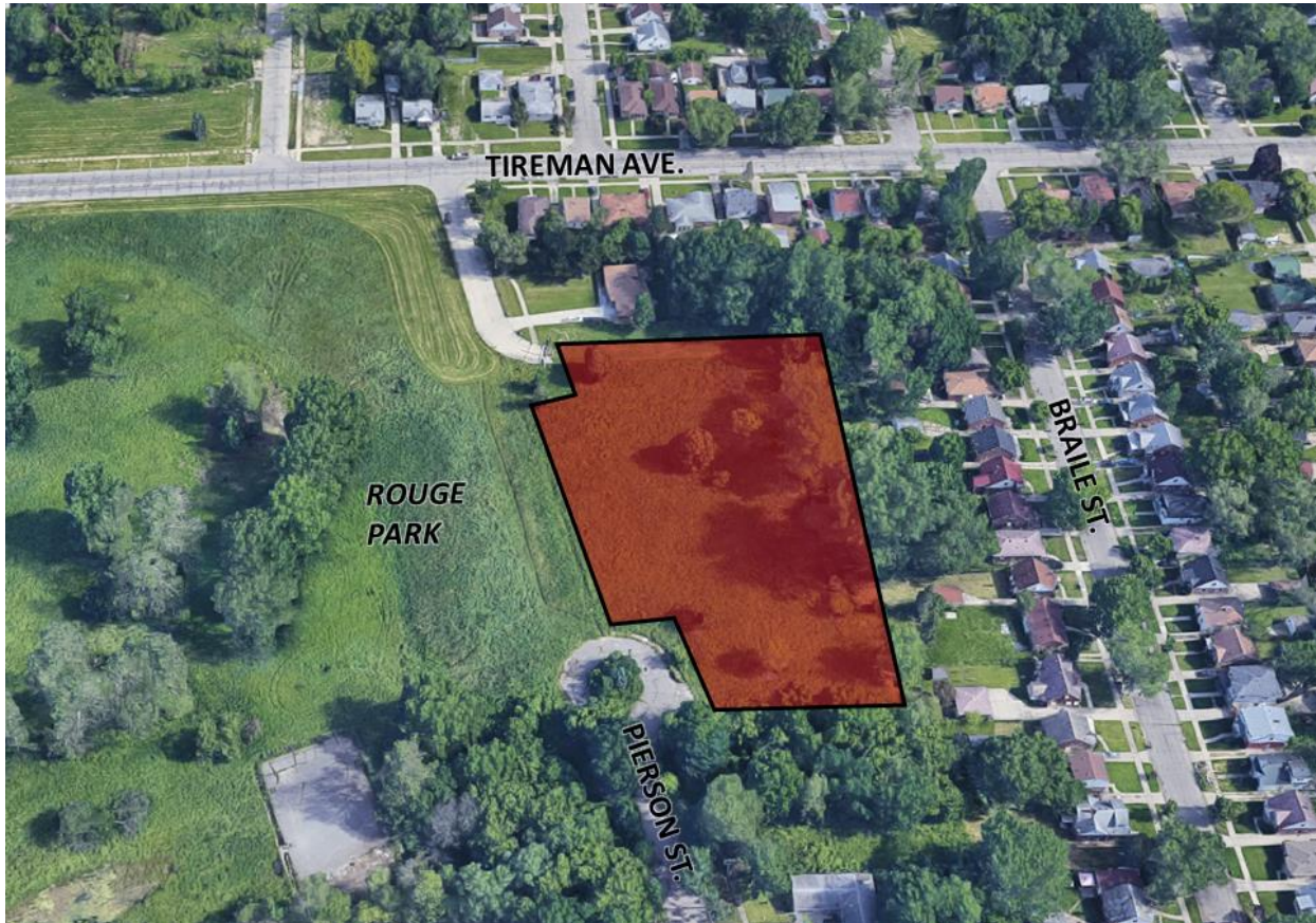
Aerial view of proposed rezoning

Although the facility trains people to trim trees, the noise generated is minimal. Most of the onsite instruction is indoor classroom work and learning to climb using safety equipment. The noisiest portion of the instruction is the tree chipper training which occurs approximately ½ day per month.