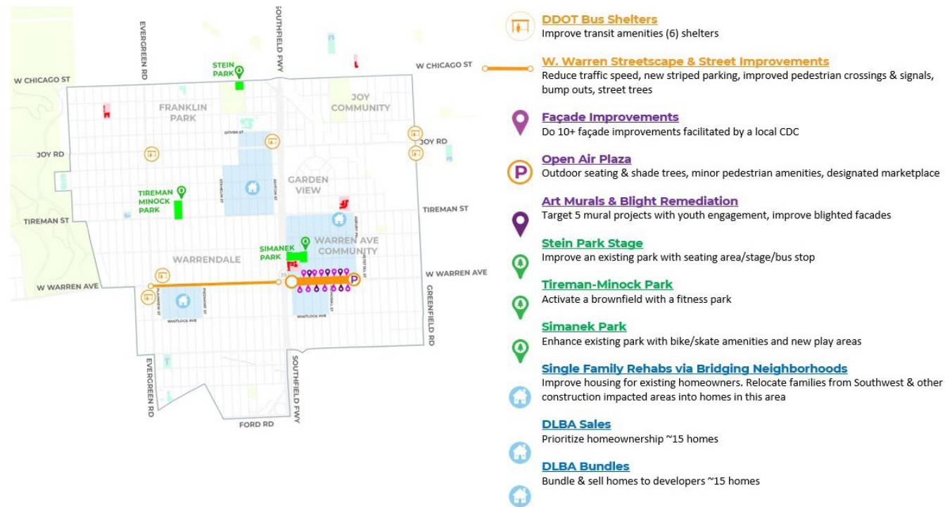
map of Warrendale Cody Rouge Planning Area

In addition to its significant single-family housing stock, Warren Avenue & the Warrendale neighborhood feature higher density residential homes, multi-story apartments, along with independent retail and walkable streets and blocks. The site is also within blocks of planned developments for the W. Warren streetscape, commercial business façade improvements and Simanek Park; bringing a vibrant mix of visitors and neighborhoods to the Detroit area. A map of SNF projects in the surrounding area is included below.