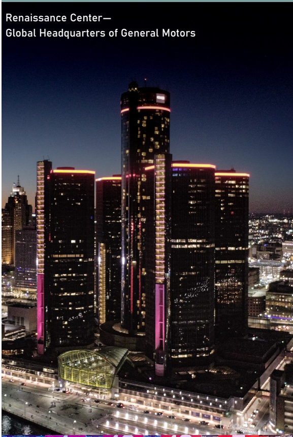
Renaissance Center— Global Headquarters of General Motors