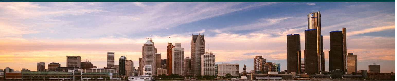
Detroit skyline from Windsor, ON