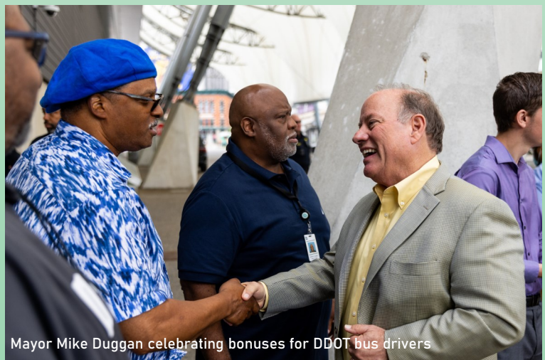
Mayor Mike Duggan celebrating bonuses for DDOT bus drivers

While Detroit is known as a hard-working city with grit and grace, its residents also like to play and are ardent supporters of the four professional sports teams that all play in downtown Detroit. The Motor City is a great place to live, work and play.