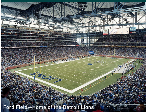
Ford Field – Home of the Detroit Lions