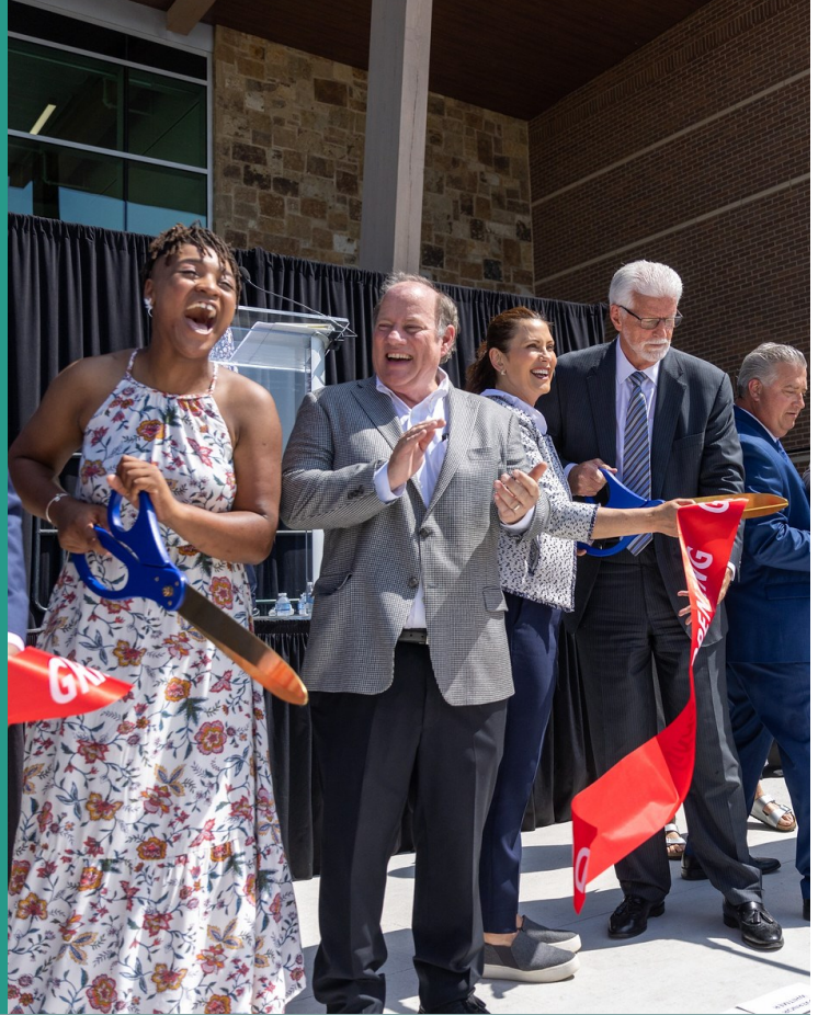
Mayor Mike Duggan and Governor Gretchen Witmer at the ribbon cutting ceremony of the new Union Carpenters and Millwrights Skilled Training Center