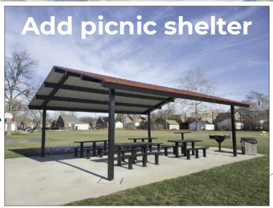
Add picnic shelter