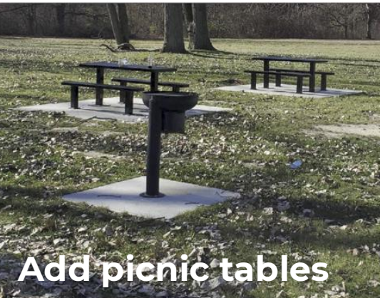
Add picnic tables