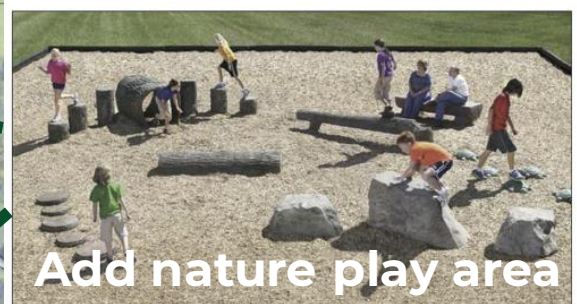
Add nature play area