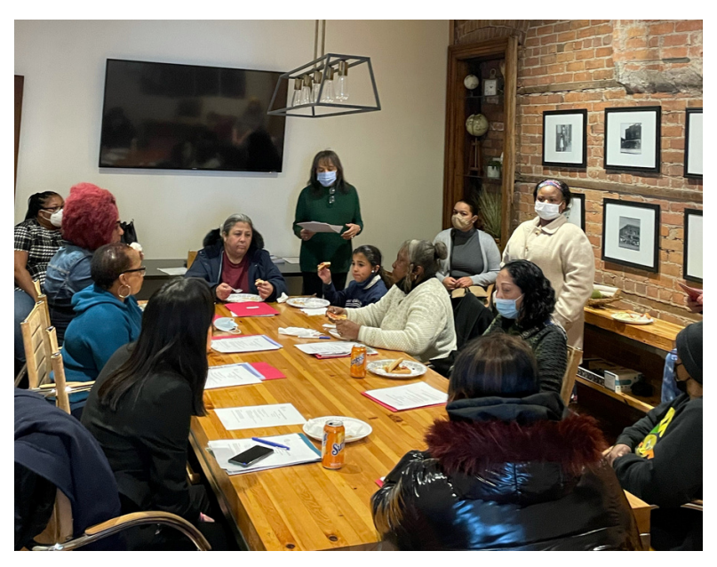
Attendees at February's Clement Kern Gardens Resident Council meeting at the TCB Community Life office.