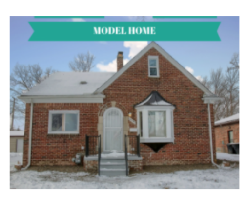
16793 Blackstone № 1345 😕 3 🚱 1