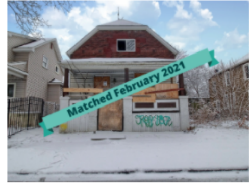
Lane ★ 1136 😕 4 🍞 1

Bridging Neighborhoods has offered homes in many neighborhoods throughout the city of Detroit. There has always been an overwhelming demand in Southwest Detroit, Springwells, and Greater Southwest Detroit from our program participants. Our team has worked really hard with the Community Advisory Group to offer as much inventory as we could in these neighborhoods. A mailer announcing the rollout was sent to all Home Swap participants in January of this year. It stated that in February, we would start offering 3–5 Southwest homes each month through May. With limited inventory in the Southwest Detroit neighborhoods, we cannot guarantee there will be more Southwest homes available for Home Swap after May. However, there are still great homes available in Southwest on our website and more move-in ready model homes will begin to rollout this summer.