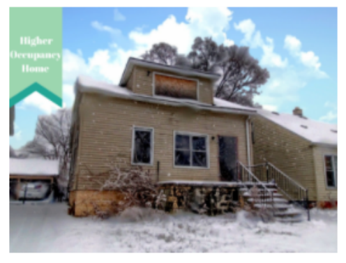
6528 Westwood № 1146 😕 5 2