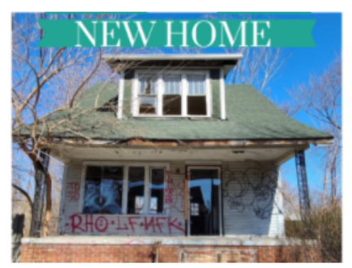
8104 Logan ☆ 878 □ 3 ० 1