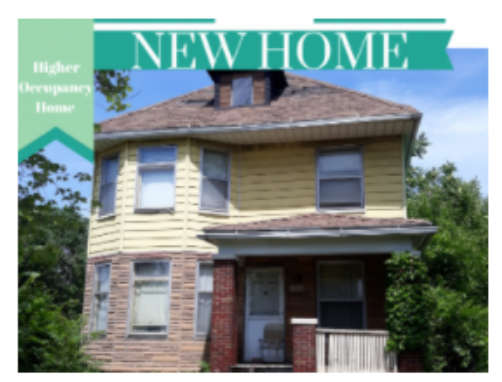
5286 24th ☆ 1,328 sq ft □ 4 % 1