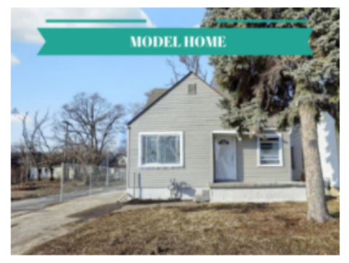
16653 San Juan ★ 796 SqFt □ 3 ► 1