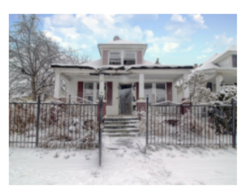
6020 Central ↑ 1135 🗀 3 🏞 1