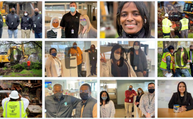
Public Service Recognition Week