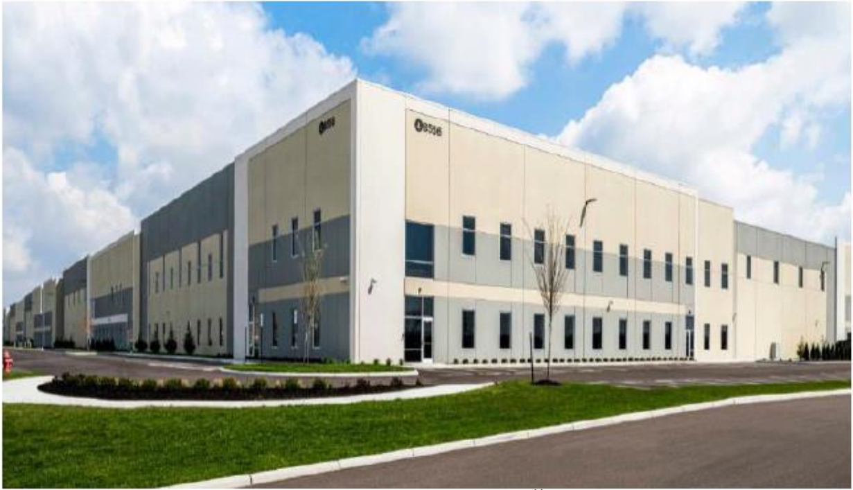
Rendering of the new facility 11