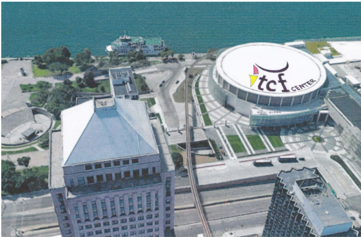
Proposed sign to be located on ballroom roof (not visible from ground)