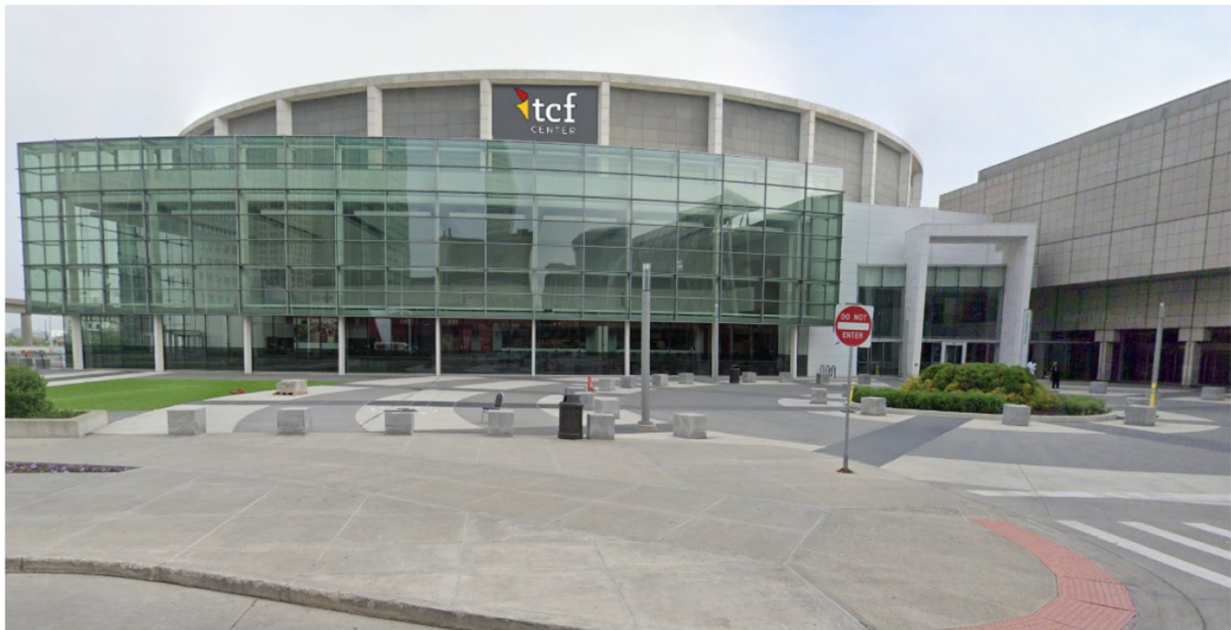
Proposed ballroom sign facing north – two other signs are proposed facing east and south (three signs total)