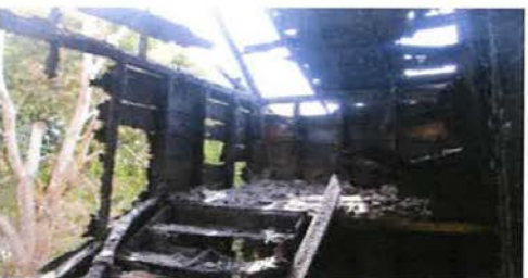
7538 American Interior2.JPG