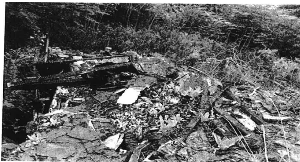
6144 Hecla 3.JPG