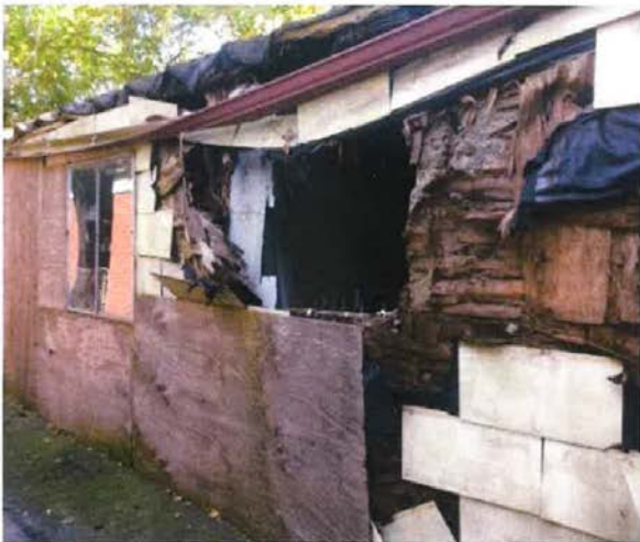
17160 Fleming - 01-14-20