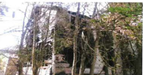
7538 American CD.JPG