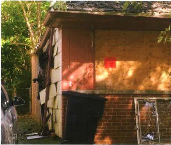
17160 Fleming - 01-14-20