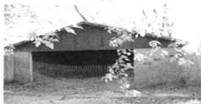
14260 LANPHERE-10-10-19-CC, MESSNER, J JPG