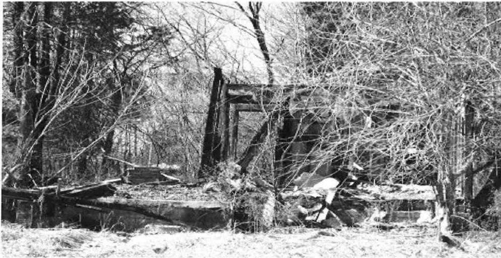
14405 WESTBROOK-3-29-18-A, MESSNER .JPG