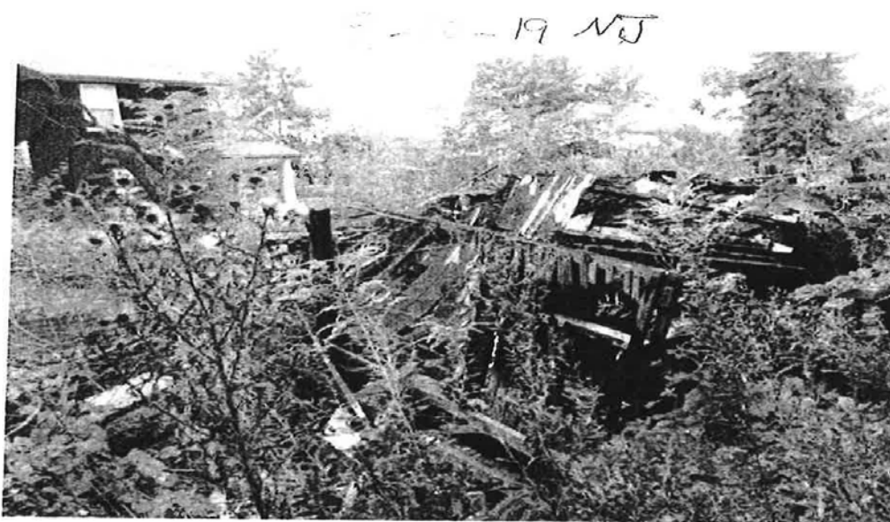
6144 Hecla 2.JPG