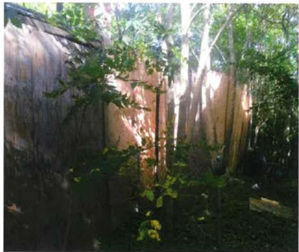
17160 Fleming - 01-14-20