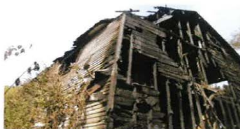
7538 American BC.JPG