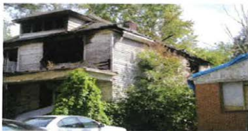
7538 American E.JPG