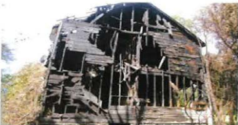
7538 American C.JPG