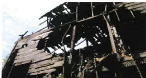
7538 American C2.JPG