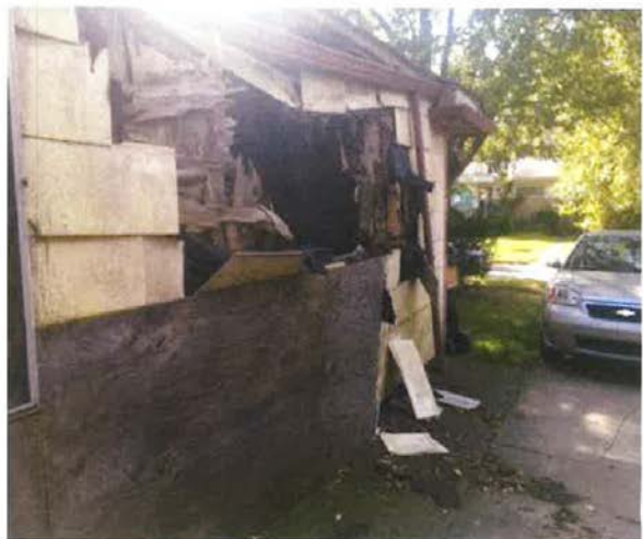
17160 Fleming - 01-14-20