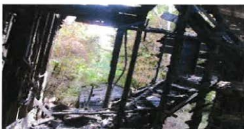
7538 American Interior1.JPG