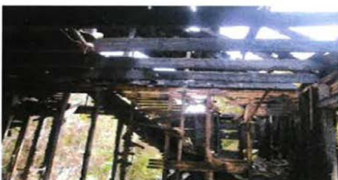
7538 American Interior3.JPG