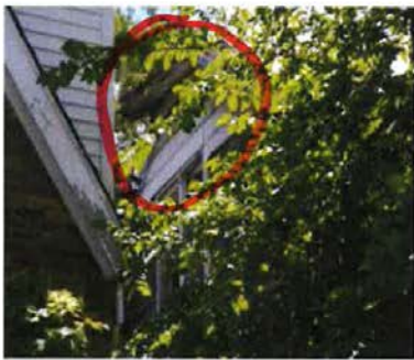
13992 YOUNG 5.JPG