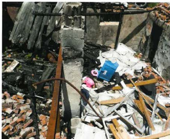
17353 Albion COM debris.JPG