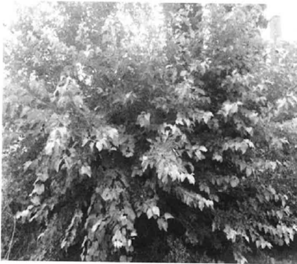
19734 Hull A.JPG