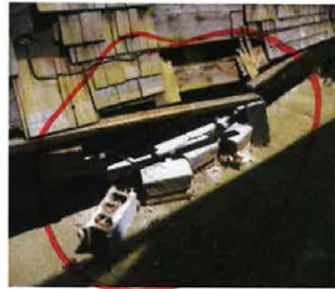
13992 YOUNG 4.JPG