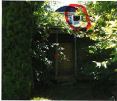
13992 YOUNG 1.JPG