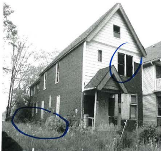
4510 sheridan ds.JPG