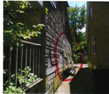
13992 YOUNG 2.JPG