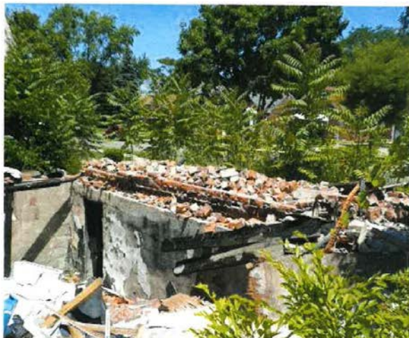
17353 Albion COM basement.JPG