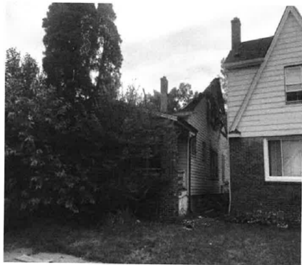
19734 Hull B.JPG