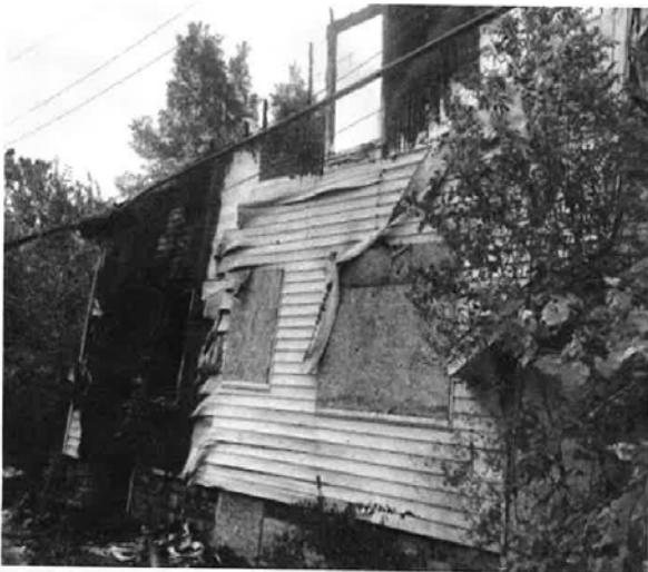
19734 Hull D.JPG