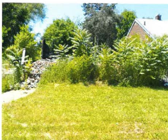
17353 Albion COM street.JPG