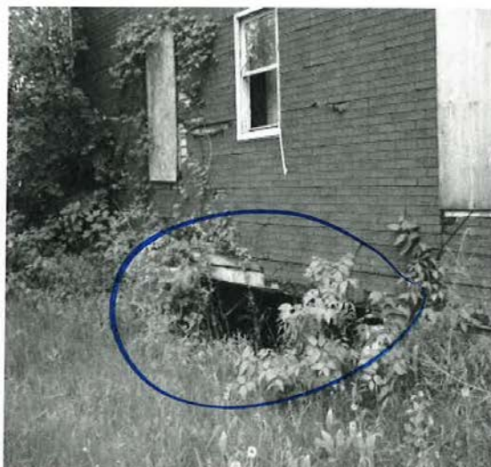
4510 sheridan d rear foundation.JPG