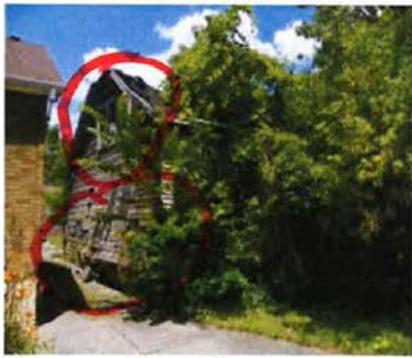
13992 YOUNG 3.JPG