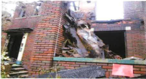
3239-41 Sturtevant A.JPG