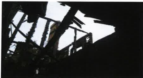
3239-41 Sturtevant Interior1.JPG