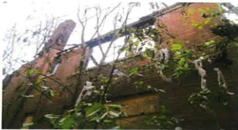
3239-41 Sturtevant B.JPG