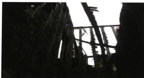
3239-41 Sturtevant Interior3.JPG