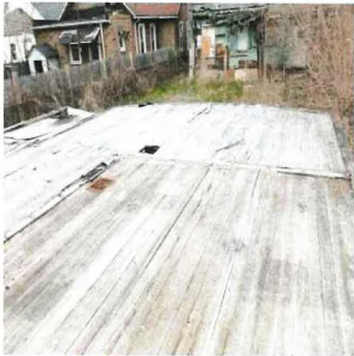
1433 MCKINSTRY 102 DECK HOLE.JPG