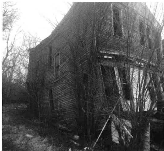
9617 Bessemore D.jpg