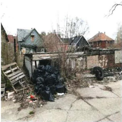
1433 MCKINSTRY 102 C.JPG