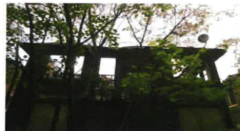
3239-41 Sturtevant C.JPG