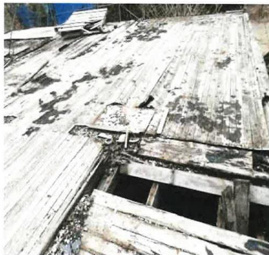
1433 MCKINSTRY 102 DECK HOLES.JPG