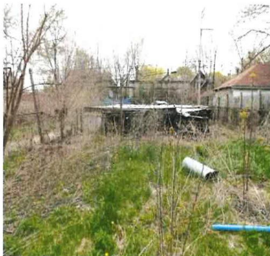
1433 MCKINSTRY 102 B.JPG