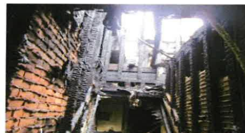
3239-41 Sturtevant Interior2.JPG