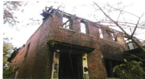
3239-41 Sturtevant AD.JPG