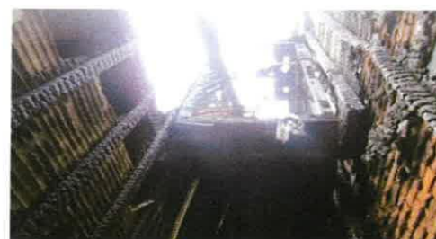
3239-41 Sturtevant Interior4.JPG