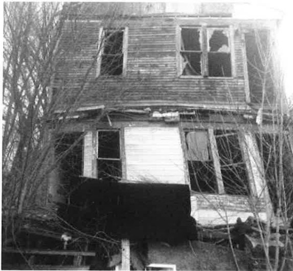
9617 Bessemore AD.jpg