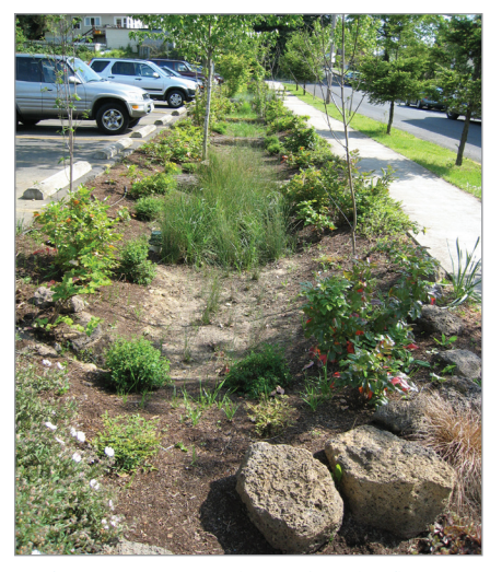
The stormwater in this parking lot flows to the outside edge where a vegetated bioretention practice was installed to manage the water before it leaves the property

• Removing weeds regularly (more frequently during first couple of years).