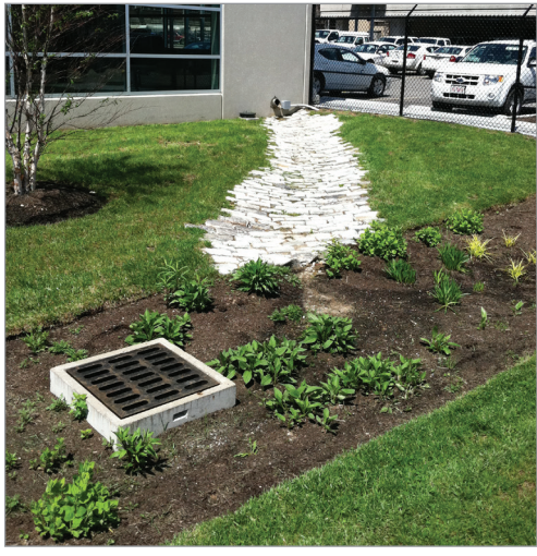
Stormwater from the building's downspouts is directed into this bioretention practice