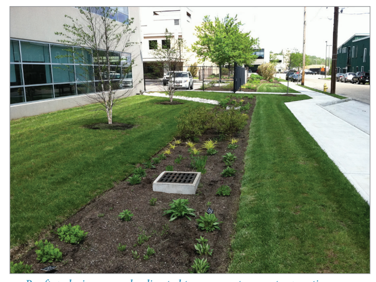
Rooftop drainage can be directed to a green stormwater practice, as shown here, before overflowing into the combined sewer system.

http://therouge.org/our-wrik/river-restoration