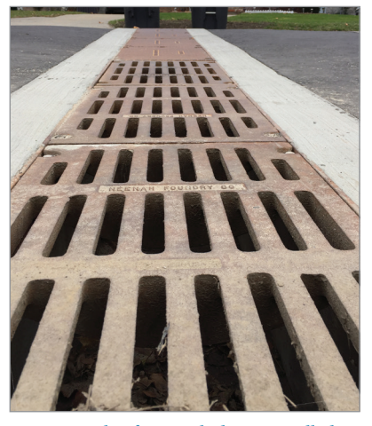
An example of a trench drain installed to capture runoff prior to entering the catch basin connected to DWSD's sewer system