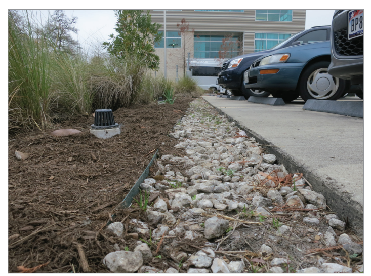
Stone infiltration trench installed around the outside perimeter of an existing parking area to manage the runoff from the parking area.

Uncontrolled document when printed. Refer to website for most current version.