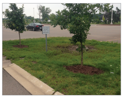
Bioretention areas within parking area islands