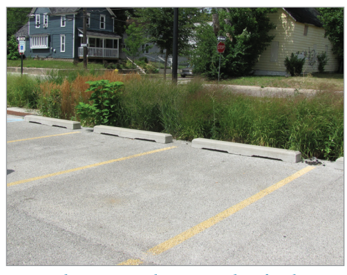
Linear bioretention along outer edge of parking area captures the runoff