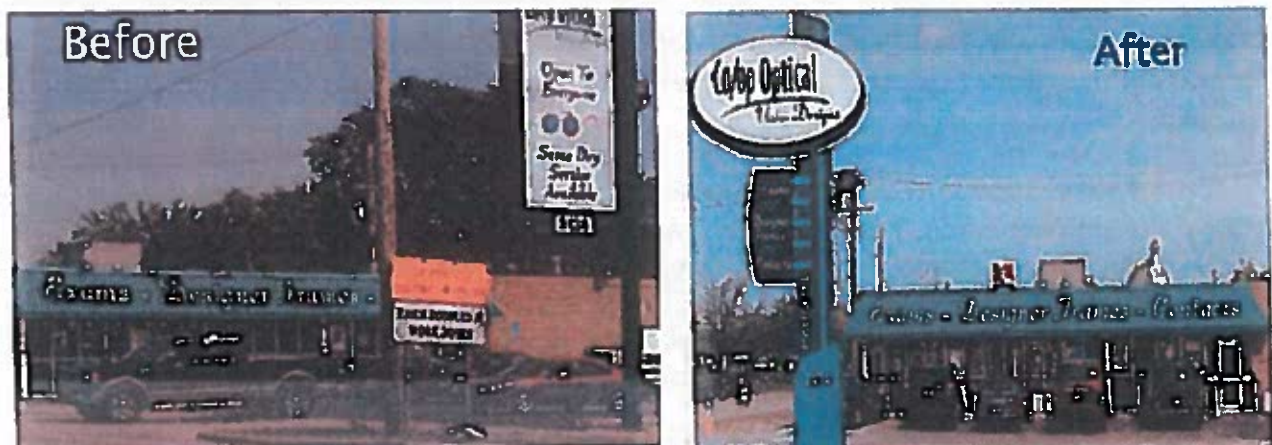
This business received a matching grant for a new sign on Eight Mile Road

Refresh Detroit is ONCR's Façade Renovation and Exterior Structure Habilitation program. It provides matching grant money and architectural assistance to community based organizations (CBOs) to assist small businesses with façade improvements. The ONCR has completed façade renovation projects and is directly responsible for improving the "look" of the commercial districts which complements the growing residential development.