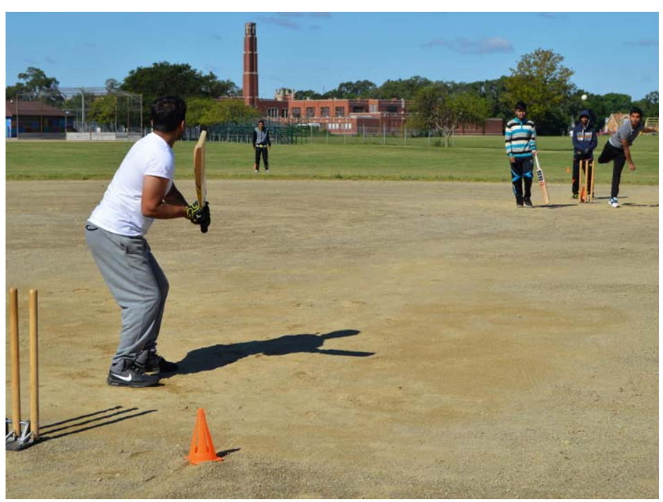
In your neigborhood (current)