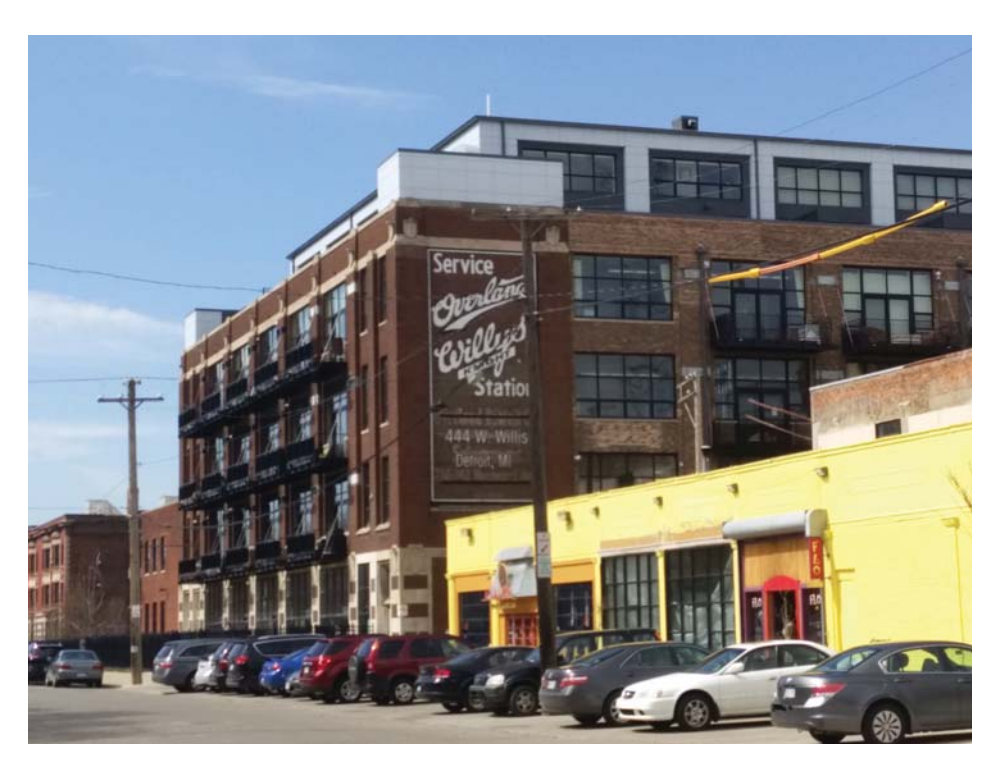
ADAPTIVE REUSE ON WILLIS STREET, DETROIT RESIDENTIAL UNITS ABOVE, FLEXIBLE PUBLIC SPACE FOR RETAIL/GALLERY ON GROUND FLOOR