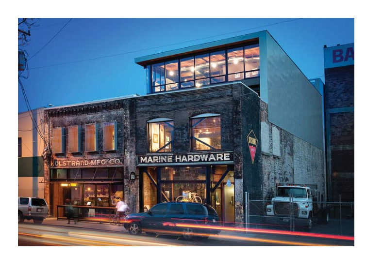
ADAPTIVE REUSE IN SEATTLE: MIX OF OFFICES, RETAIL AND RESTAURANT.

ADAPTIVE REUSE CAN HELP RETAIN THE CHARACTER OF THE NEIGHBORHOOD WHILE AT THE SAME TIME INFUSE NEW USES AND DEMAND FOR THE BUILDING.