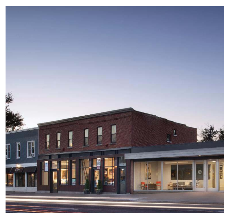
ADAPTIVE REUSE IN BOULDER, COLORADO SHOWING RESTORATION WITH RETAIL OPENING OUT INTO THE STREET