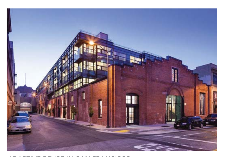
ADAPTIVE REUSE IN SAN FRANCISCO, CALIFORNIA. NEW RESIDENTIAL UNITS ADDED BEHIND FORMER OFFICE BUILDING.