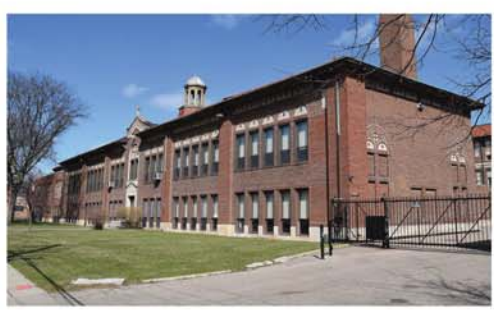
20 Former St Mary's school 16196 Grand River