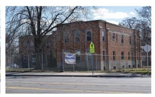
19 Vacant Building 16401 Grand River