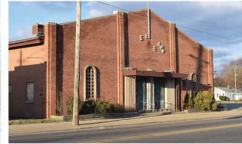
12 Unoccupied Building 22350 Fenkell