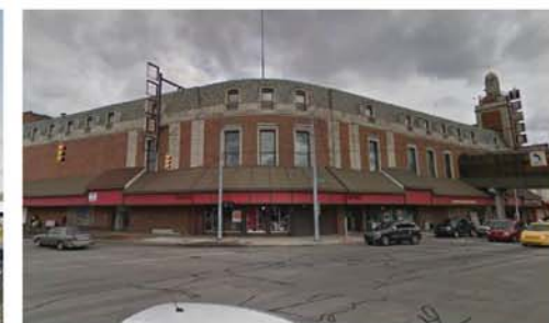
23 Tower Center 15400 Grand River